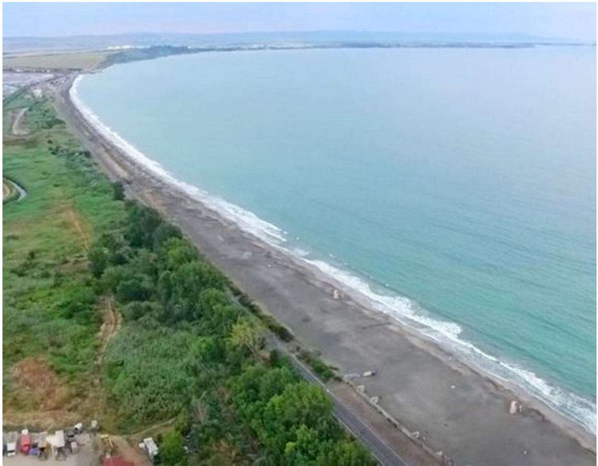
Atanasovska sand spit Beach