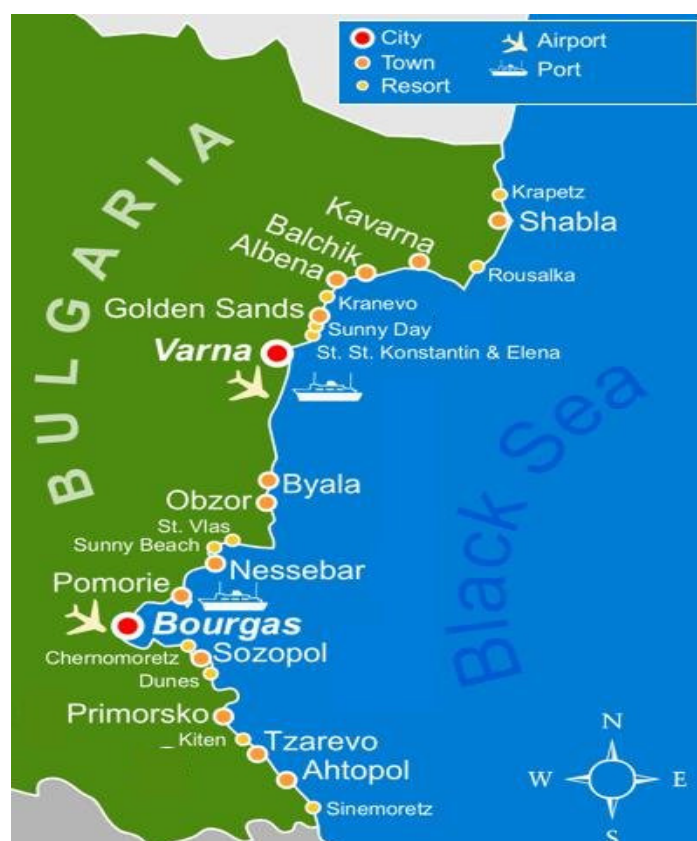
Map 1 of the Bulgarian Black Sea coast.

Burgas Region is located along Black Sea coast of Bulgaria. Six of thirteen municipalities of Burgas region are on the Black Sea cost- Nessebar, Pomorie, Burgas, Sozopol, Primorsko, Tzarevo Municipalities. Beaches in Burgas Region are composed of mainly sand .